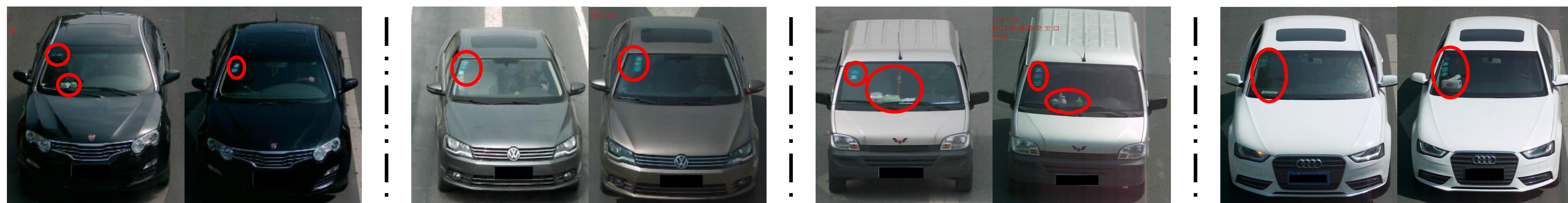
Different vehicles with similar global appearance. The local differences are highlighted with red circles.